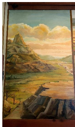
Figure 15 "Wagon Train and Mountain," artist unknown, Camp Douglas, Wyoming, 1943. Photograph by Laura E. Ruberto, 2020

Other kinds of creative products also exist that (similar to the Camp Douglas murals) balance individual craft and collective imagination: including Italian-language camp newspapers (e.g., Domani at ISU Camp Ogden, UT; Noi at non-collaborating POW Camp Schofield, Honolulu, HI) and a bound artistic volume (e.g., Il Guado at non-collaborating POW Camp Hereford, TX). xlvii