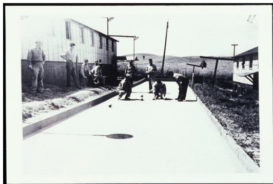
Figure 13 Bocce court within the Italian Service Unit camp, Benicia, California, circa 1944.

and represent the enactment of an Italian lived cultural heritage and the networks of influence on communities outside the borders of the camps.