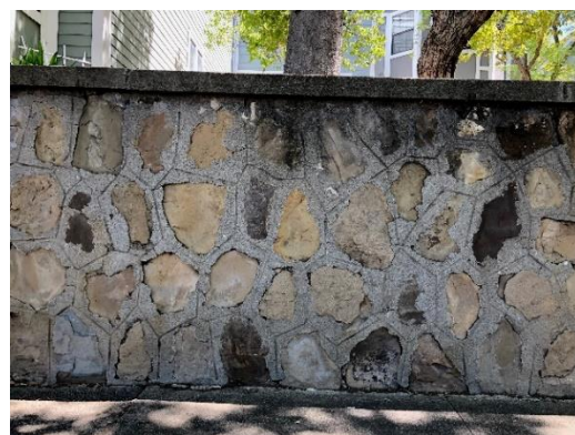
Figure 11 Stone and concrete retaining wall (detail), built by Italian Service Unit men, Benicia, California.

Collectively made secular spaces and structures were also common. Italians shaped much of the general landscape of the camps and in some cases even constructed camp buildings. A handful of hardscape work, sometimes decorative, other times practical, is still in existence and mark those local territories by the historical realities of the people who were there before them, becoming a quiet but visible cultural heritage presence of the POWs. These structures include a fountain and a sculpture near Honolulu, HI, a sculpture at Camp San Luis Obispo, CA, a fountain at Camp Roberts, CA, a brick wall near the former camp in Benicia, CA, and a now-dismantled “Star of Hope” fountain at Fort Benning, GA (Coker and Wetzel 2019, 100).