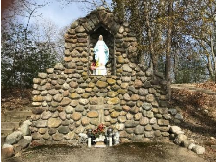
Figure 9 Altar, built by Italian Service Unit members, near Taunton, MA. Photograph by Laura E. Ruberto, 2018

Christmas afforded a heightened opportunity for creative expressions around religious traditions more commonly associated with Italian families; actions that were adapted for the entire camp and even the community beyond the camp. Such adaptations to the dislocated space of the POW camp places them in line with Italian diasporic traditions, a point well illustrated through the bricolage and hybrid creations by POWs of presepi . The uniqueness of Italian POW nativity scenes aligns them very much with the ways Joseph Sciorra discusses the miniature Christmas landscapes found in Italian New Yorkers' homes, noting them as an ephemeral "fantasyscape ... enlivened by narrative and performance in the service of Christian pedagogy, autobiography, and family history, and the engendering and strengthening of community affiliation" (2015, 63). The POW- presepi illustrate some of the ways that craft and design helped men express their faith, share in cultural traditions, abate nostalgia or loss for home and family, and at the same time bear witness to the unique moment they were living. In 1943, in the POW camp in Douglas, WY, prisoner and sculptor Giannino Gherardi worked on the creche in his barracks which in his