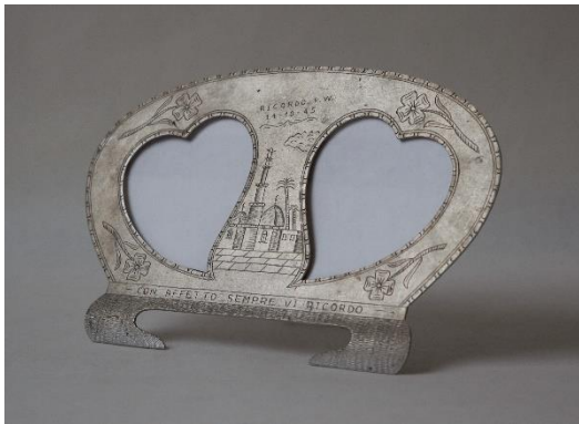
Figure 5 Italian POW-made photo frame, artist unknown.

intentionality of the builder through imagery and inscriptions. Many tin cigarette holders, small wooden boxes and other mementos have images that appear to be reminiscent of the North African desert—were they made while men were in North Africa or were they souvenirs of their time there? Other items have inscriptions simply of P.W. (prisoner of war) or a short phrase, such as “Con affetto sempre vi ricordo” (I remember you both always with affection) on a metal picture frame. Given the lack of an institutional practice of collecting, documenting, or preserving such items it is near-impossible to track the histories of such suggestively marked items.