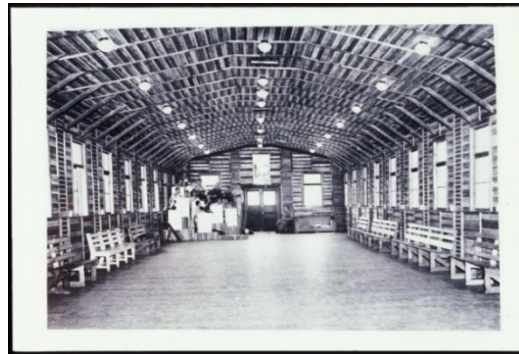
Figure 12 Dance Hall, built by Italian Service Unit members, Benicia, California (note inclusion of bandstand with musicians), circa 1944.

with their hands...so we was pretty particular and we did a beautiful job” (1998). xlv