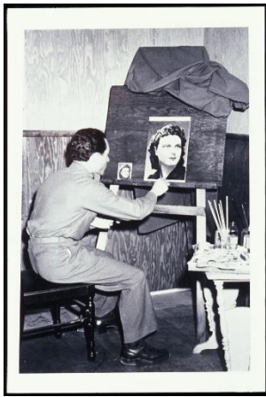
Figure 8 Italian Service Unit soldier painting, Benicia, California, artist/year un- known. Author's Collection

personalized, signed items were less likely to be discarded, donated, or sold? The personal, individualizing of such objects are particularly difficult to understand today without the deep knowledge of family and context. As Carr and Mytum explain: “to us as researchers, the items of creativity that have survived into the present are not easy to understand individually, even at fixed points in their lives such as at the moment of creation” (2012, 14). Too often these smaller, tangible items, are only known to us today through photographs and written descriptions of group art shows and unidentified artists. xxxviii